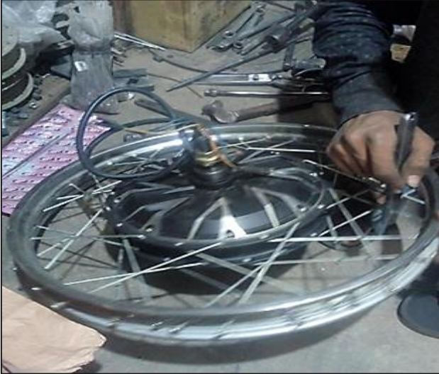
Figure 3: The Wheel Throwing Process

The BLDC Hub drive was mounted on the front wheel of the motorcycle. The BLDC hub motor was connected using spokes. It is balanced properly; therefore, there should be no wobbling in the wheel. The wheel throwing process is shown in Figure 3, in which a technician mounts the BLDC Hub motor on the rim.