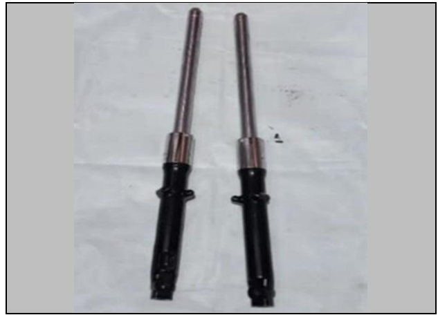
Figure 5: Front Suspension Bars

These suspension bars were cut into half, the dampers were removed, and the bar was separated by cutting. See Figure 5.