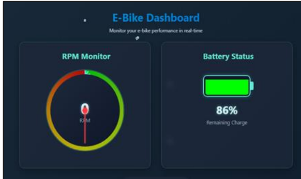
Figure 9: Real-Time Dashboard