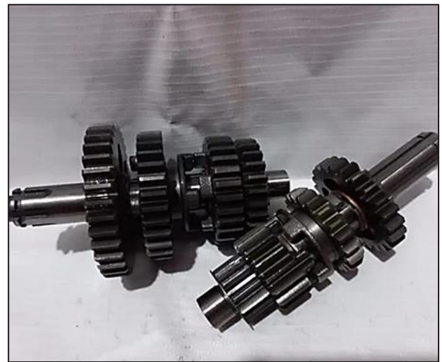
Figure 1: The Gears of 70cc Gearbox

The gearbox is the main part of a 70cc motorcycle engine, which transmits the power of the engine to the wheels of the motorcycle. In the gear box, a combination of gears is formed to increase and reduce the torque upon shifting the combination of the gears using the gear lever. The gear box of a 70 cc motorcycle has four gear shifts. The gears of the gear box of the 70 cc motorcycle are shown in Figure 1.