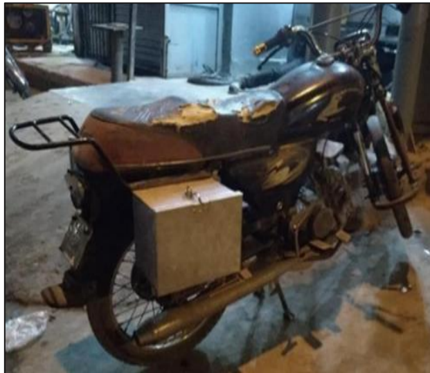
Figure 8: Battery and Controller Junction

A Battery Management System (BMS) is a type of control system used to monitor and manage the performance of a rechargeable battery. The main functions of a BMS are to protect the battery from damage, extend its lifespan, and improve its performance (Figure 8).