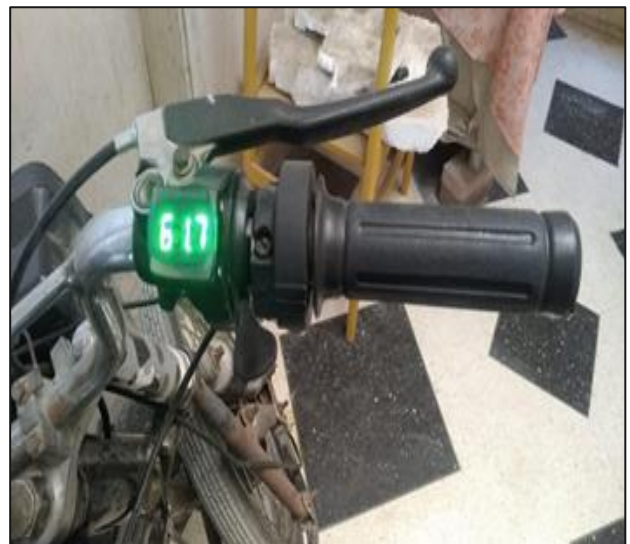
Figure 6: Electric Thumb Throttle

An electric bike throttle is a device used to switch the speediness of an electric bike. It typically operates independently of pedaling, allowing the rider to control the speed of the bike by turning the throttle with their hands. Some e-bikes have a twist-grip throttle on the handlebar, whereas others use a thumb or trigger throttle. The throttle provides a convenient way to control the power delivery from the e-bike's electric motor, making it easier to ride and maneuver. In this case, a thumb throttle with an LCD mounted on the handlebar was used, as shown in Figure 6. The LCD shows the voltages of the BLDC hub motor.